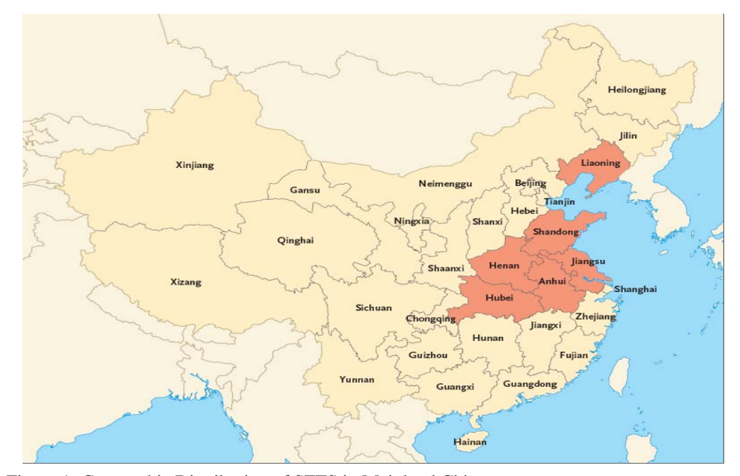
Figure 1: Geographic Distribution of SFTS in Mainland China. (Yu et al. N Engl J Med. 2011;364(16):1523-32)Areas where SFTS surveillance was carried out and SFTS bunyavirus was isolated from patients are shown in red.

syndrome virus (SFTSV). Genetic analysis revealed that the virus was a newly member of the genus phlebovirus in the Bunyaviridae Electron-microscopical family. examination revealed virions with the morphologic characteristics of а bunyavirus (Figure. 2)<sup>[2]</sup>. Bunyaviridae are vector-borne viruses, and have tripartite genomes consisting of a large (L), medium (M), and small (S) RNA segment. The L segment encodes the RNA Dependent RNA-polymerase, necessary for viral RNA replication and mRNA synthesis. The M segment